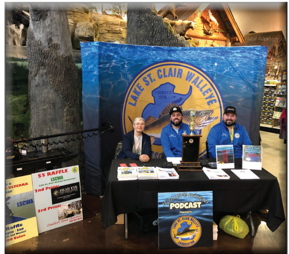
LSCWA members out in the wild spreading the word about our club