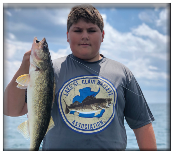
Gauge from Alpena Showing off a beautiful walleye while wearing the LSCWA colors