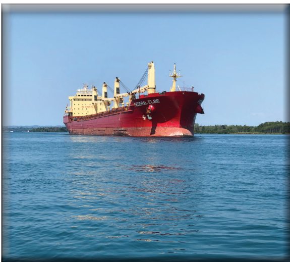
The beautiful Federal Elbe hard at work on Lake St. Clair