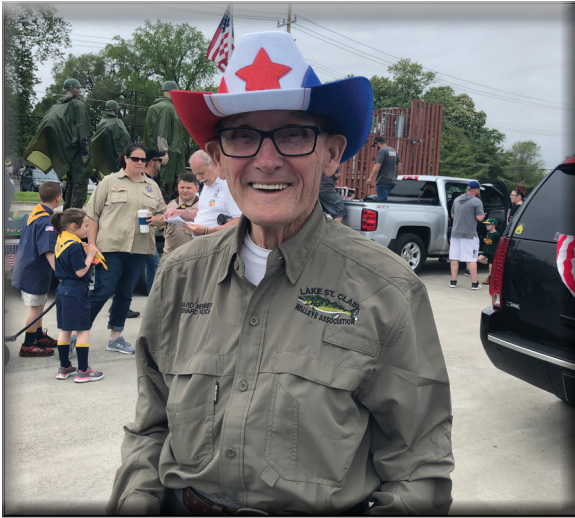
Cookie having fun at the SCS Memorial Day parade